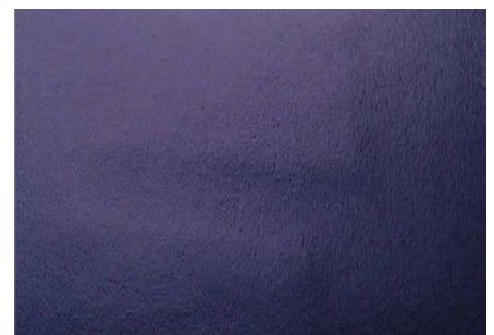
Satiné Noir 2162991

For more information from CTN Exhibitions: